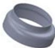
Adapter /Eccentric Reducer Ø 120 to 150 mm