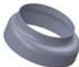
Adapter /Eccentric Reducer Ø 120 to 150 mm